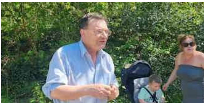
All an absolutely wonderful time, without doubt brought about only by the Lord working with our efforts. And again we marvel that all this started from folks following Pub Church in south London.