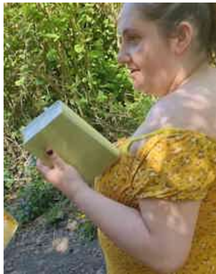
We gave a Bible study and baptism service on the river shore, with other folks listening respectfully. Quite a witness.