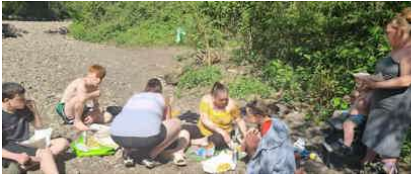
You can see plenty of NEV Bibles in use...